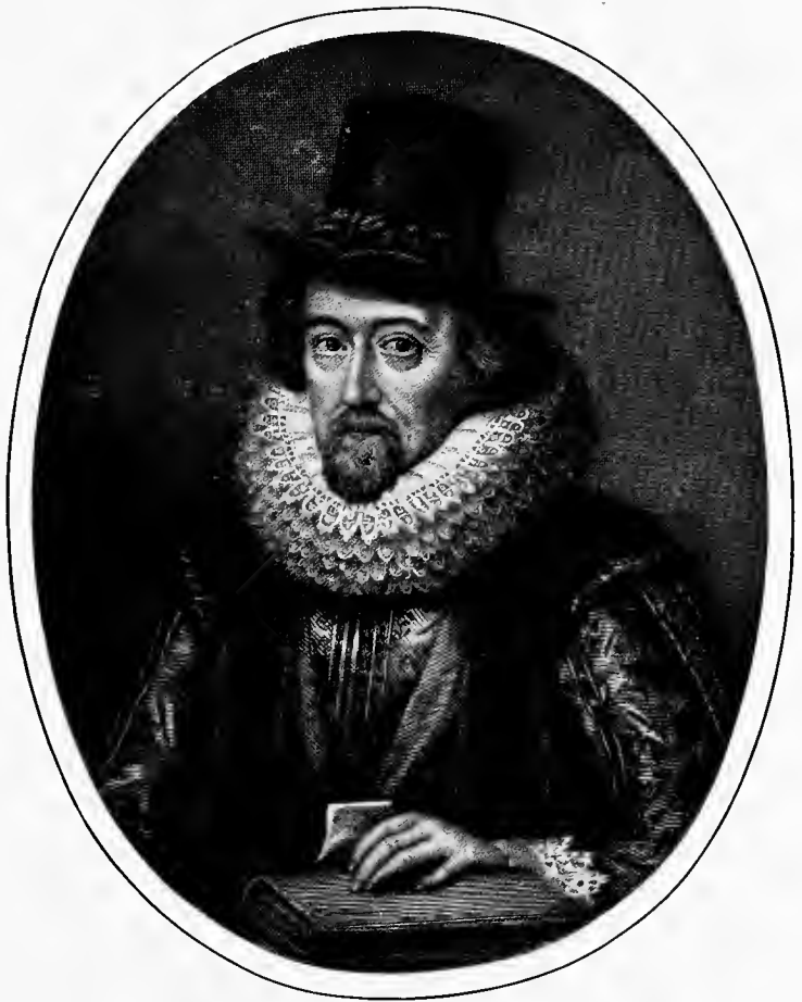
SIR FRANCIS BACON